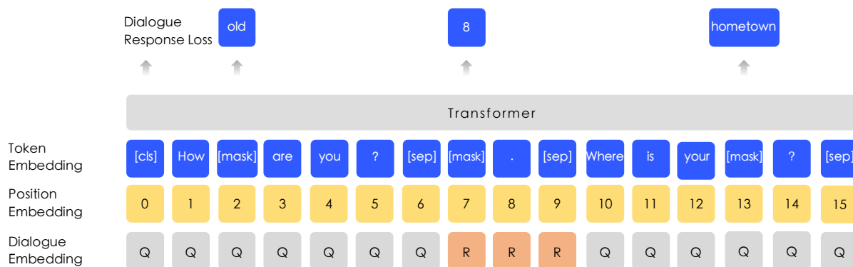
Figure 3: Dialogue Language Model. Source sentence: [cls] How [mask] are you [sep] 8 . [sep] Where is your [mask] ? [sep]. Target sentence (words the predict): old, 8, hometown